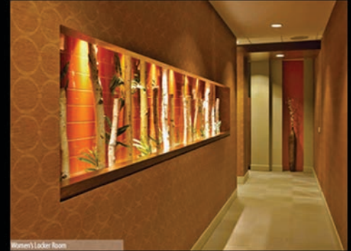
Women's Locker Room