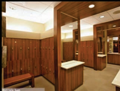
Men's Locker Room